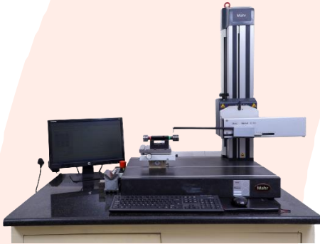
Contour Measurement Services