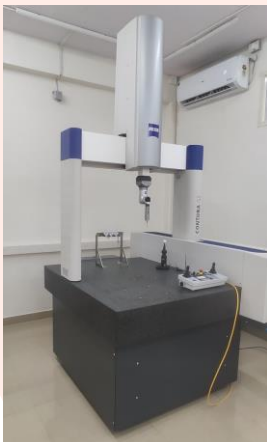
Carl Zeiss 3D CMM Measurement Services