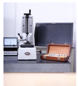
Mahr make Slip Gauge Calibrator

Mapana Metrology Pvt.Ltd is NABL accreditation Laboratory.